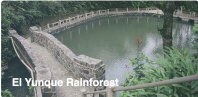
El Yunque Rainforest