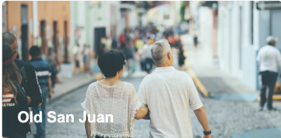
Old San Juan